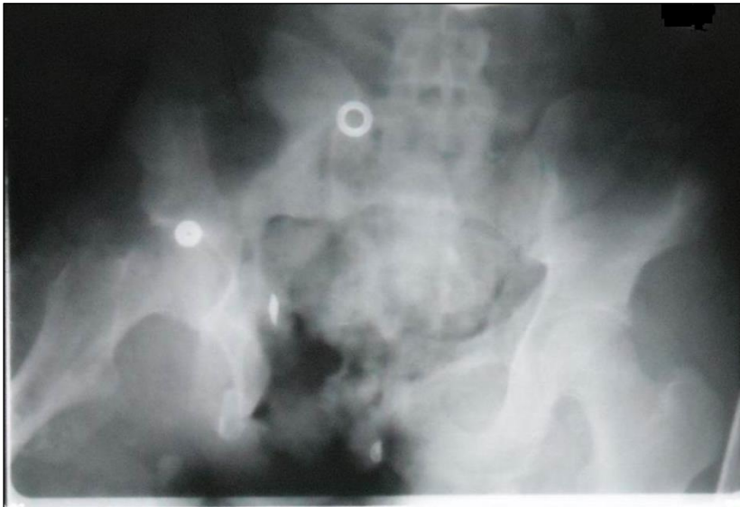
Figure 2. Open Pelvic Ring and Acetabular Fractures