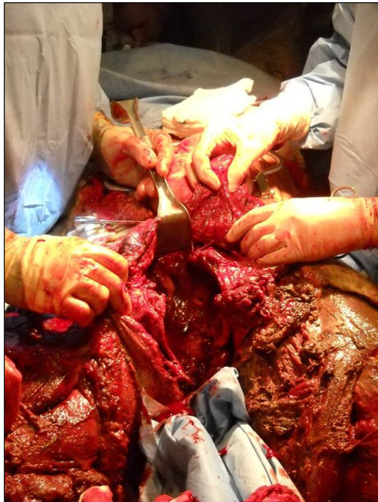
Figure 1. Dismounted Complex Blast Injuries