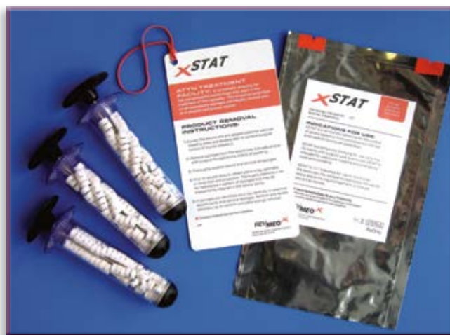
Figure 1 Photograph of one device, which consists of compressed sponges housed in a syringe-style applicator. One device consists of three applicators.