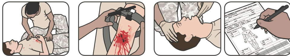
RAPID CASUALTY ASSESSMENT

The ASM TCCC Course encompasses rapid casualty assessment, lifesaving medical skills, and critical communication and medical documentation techniques.