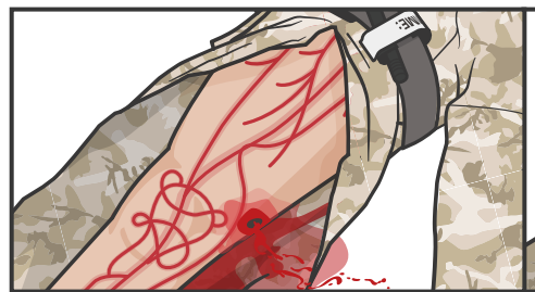
APPLY a CoTCCC-recommended tourniquet directly on skin 2-3" above the bleeding site if possible (see Tourniquet Application Instructions).