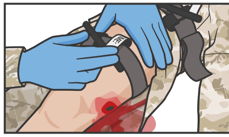
ASSESS to ensure distal pulse is absent, and bleeding is still controlled.