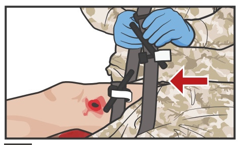
SLIDE originally placed tourniquet(s) down, but leave in place proximal to the newly placed tourniquet.

STEP 6 NOTE: If bleeding reoccurs, immediately retighten the initial tourniquet(s), ensuring bleeding is controlled, and further tighten the newly applied tourniquet. Repeat Steps 5 & 6 until the new tourniquet controls bleeding.