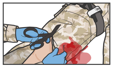
EXPOSE the injury and assess the bleeding source.

NOTE: If a Combat Lifesaver is available, direct them to assist.