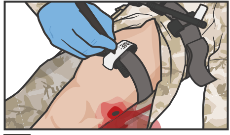
ANNOTATE the time of the 09 new tourniquet placement on the tourniquet.

STEP 8 NOTE: replaced tourniquets should not be fully tightened, but excess slack should be removed.