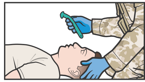
INSERT a nasopharyngeal airway.