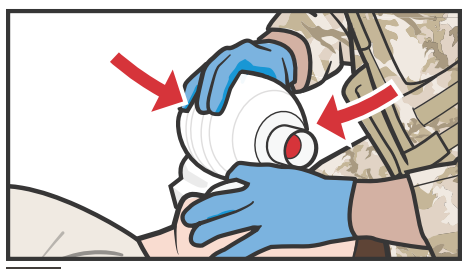
SQUEEZE the bag with your other hand for 1-2 seconds while observing the chest rise to make certain lungs are inflating effectively.