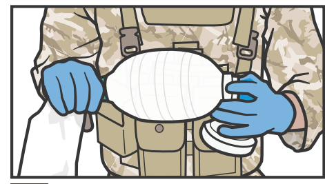
ASSEMBLE the BVM (connect the mask to port on the bag).