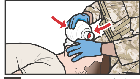
CONTINUE SQUEEZING the bag 07 once every 5-6 seconds (10-12) breaths/minute).

NOTE : Alternatively, the bag may be compressed against your leg or forearm to deliver a greater tidal volume to the patient or help with hand fatigue.