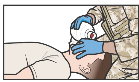
CONTINUE ventilation, observe for spontaneous respirations, and periodically check the pulse.

NOTE : Alternatively, the bag may be compressed against your leg or forearm to deliver a greater tidal volume to the patient or help with hand fatigue.