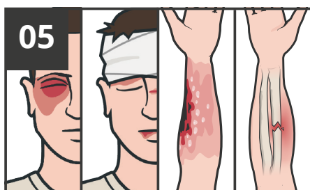
05 CHECK for other injuries including eye trauma, head injury, burns, or fractures