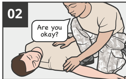
02 ASSESS the casualty for responsiveness