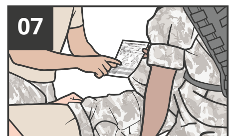
07 COMMUNICATE with medical personnel any aid provided